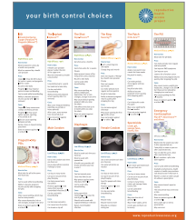
Your Birth Control Choices