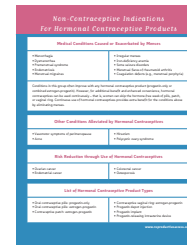
Non-Contraceptive Uses of Hormonal Contraception