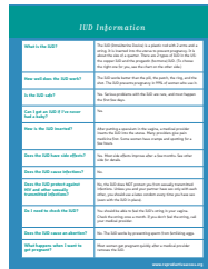
IUD Information / Which IUD is right for me?*