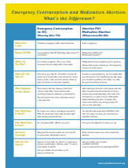
Emergency Contraception and Medication Abortion: What's the Difference?*