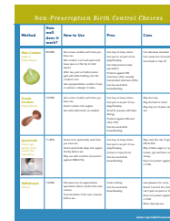
Non-Prescription Birth Control Choices*