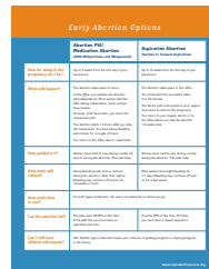
Early Abortion Options*